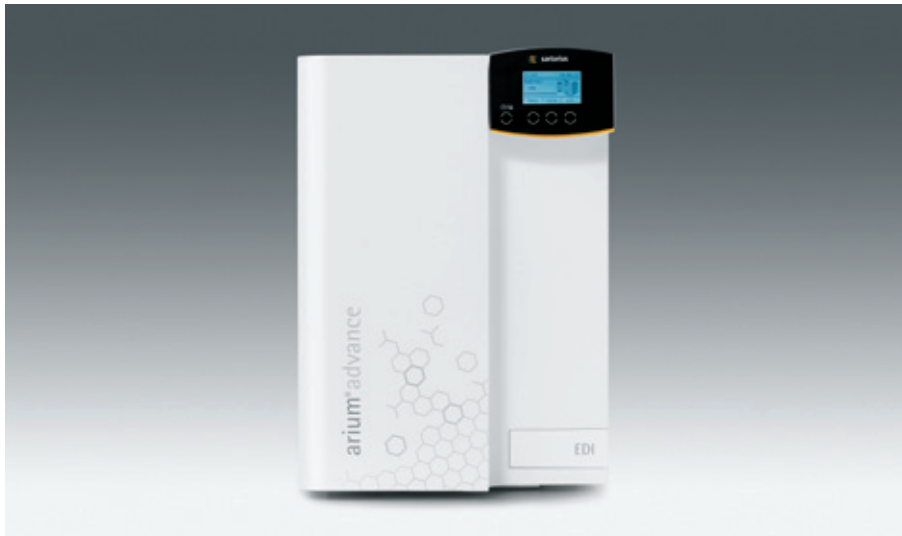
arium® advance EDI Type 2 pure water system

Ultimate Reliable Electrochemical Deionization