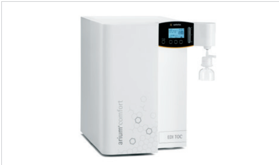
arium® comfort II ASTM Type 1 and Type 2 water purification system